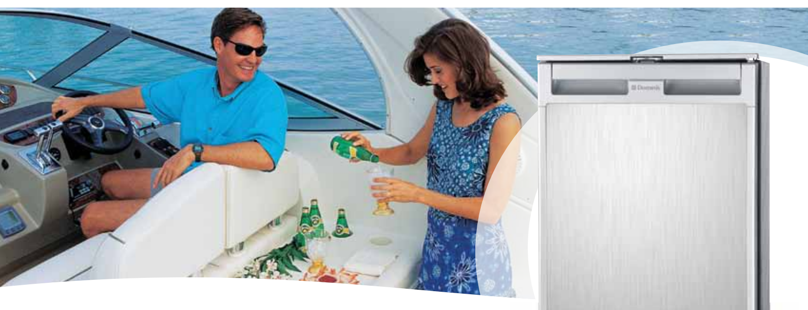
CR-1080E-S shown without flange

Luxury meets performance and top-of-the-line technology with Dometic's CR Series of premium refrigerators with freezer compartments. CR refrigerator/freezers are constructed for the rigors of marine use, but designed to compliment any galley or cockpit.