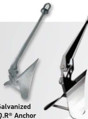
Galvanized C.Q.R.® Anchor

The C.Q.R.® anchor has gained legendary status for its superior performance. The original drop-forged construction of the C.Q.R.® anchor increases its strength and reliability under load – a genuine C.Q.R.® anchor will not break. Its hinged shank delivers consistent setting and holding even in the very worst conditions. The C.Q.R.® anchor is guaranteed for life against breakage* and has Lloyd's Register General Approval of an Anchor Design 2 as a High Holding Power anchor.