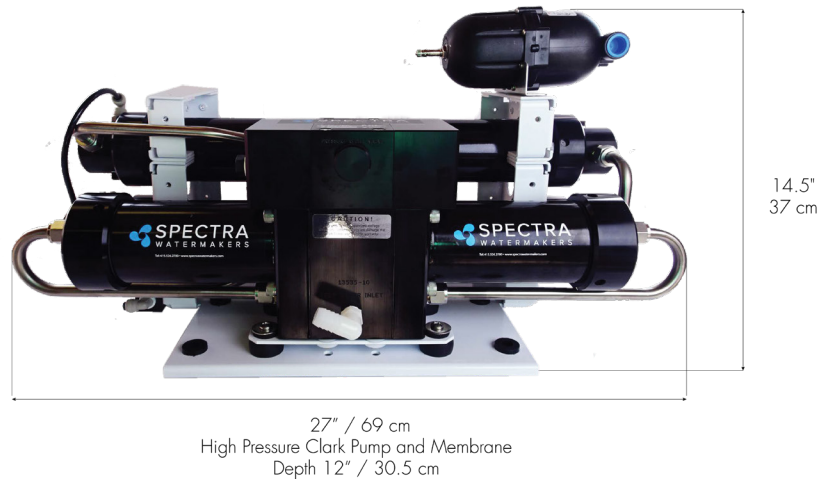
27" / 69 cm High Pressure Clark Pump and Membrane Depth 12" / 30.5 cm

Katadyn reserves the right to modify products