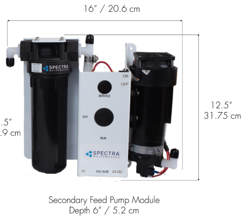
Secondary Feed Pump Module Depth 6" / 5.2 cm