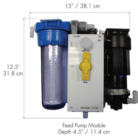
Feed Pump Module Depth 4.5" / 11.4 cm